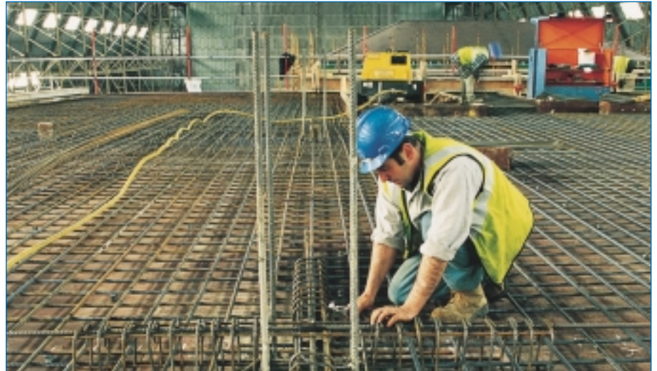
Figure 1: Fixing reinforcement on the in-situ concrete building at Cardington

This Guide provides recommendations for the more efficient supply of reinforcement by improving the transfer of information, and by re-engineering the flow of process information from the designer through to the fixer