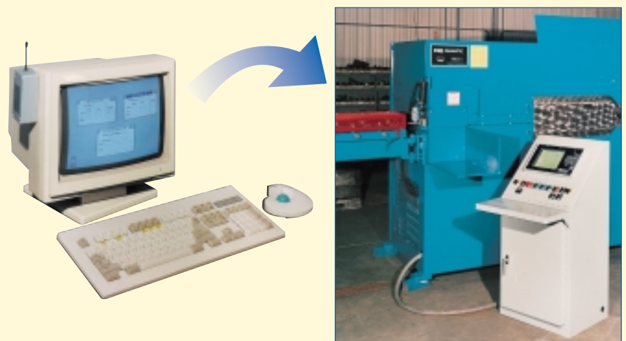
Figure 4: A bending machine controller obtains information directly from the office database